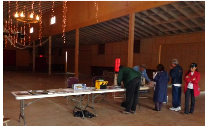
AAOA Silent Auction at March meet at Old Tucson