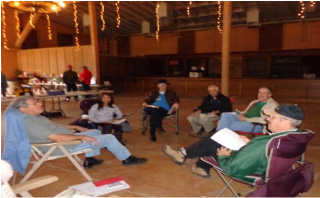
AAOA March meeting held at Old Tucson