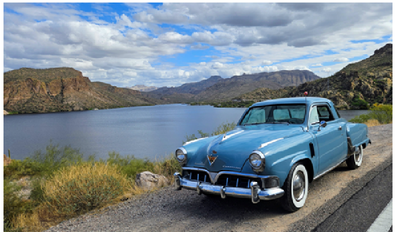
On the Trail