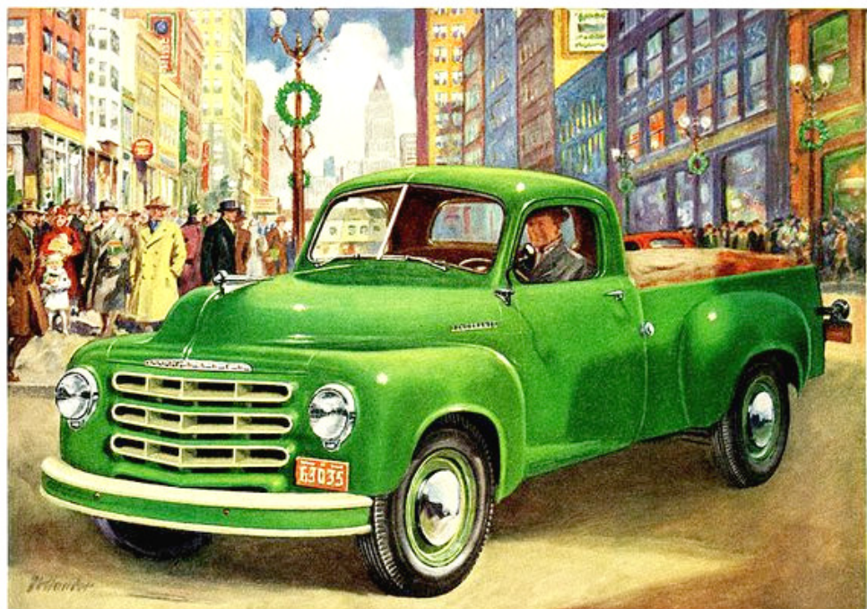
1/2-ton 6 1/2-foot pickup—1-ton and 1 1/2-ton 8-foot pickups are also available